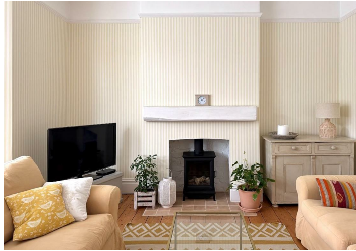
2 Church Road